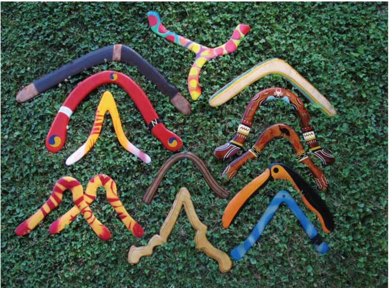
The 'escapees' pose for group photo

My throwing sessions are usually somewhat planned in advance; there's a certain weather/wind and some booms I want to throw. Recently though I had an unplanned and interesting weekend session. It started with The Boxes, four plastic bins that contain nearly 30 years of boomerangs, t-shirts, and other boomerang-related "stuff". When I grabbed the top t-shirt bin to move it, the bottom snagged the cover of the second bin that was filled with booms and pulled it over until I stopped the fall with my hip, but a few booms fell out. Surveying the eclectic mess on the floor, and narrowly averted huge mess, it seemed obvious that the only logical action before repacking the entire bin ("as contents may shift in flight...") was to acknowledge these rogue escapees with a throw at Sachem Field. I also grabbed a Toucan-decorated rang, on loan from Eric Darnell, because it was one of the first rangs I recall seeing when I visited Eric's home in 1981, and I wanted to see it fly.