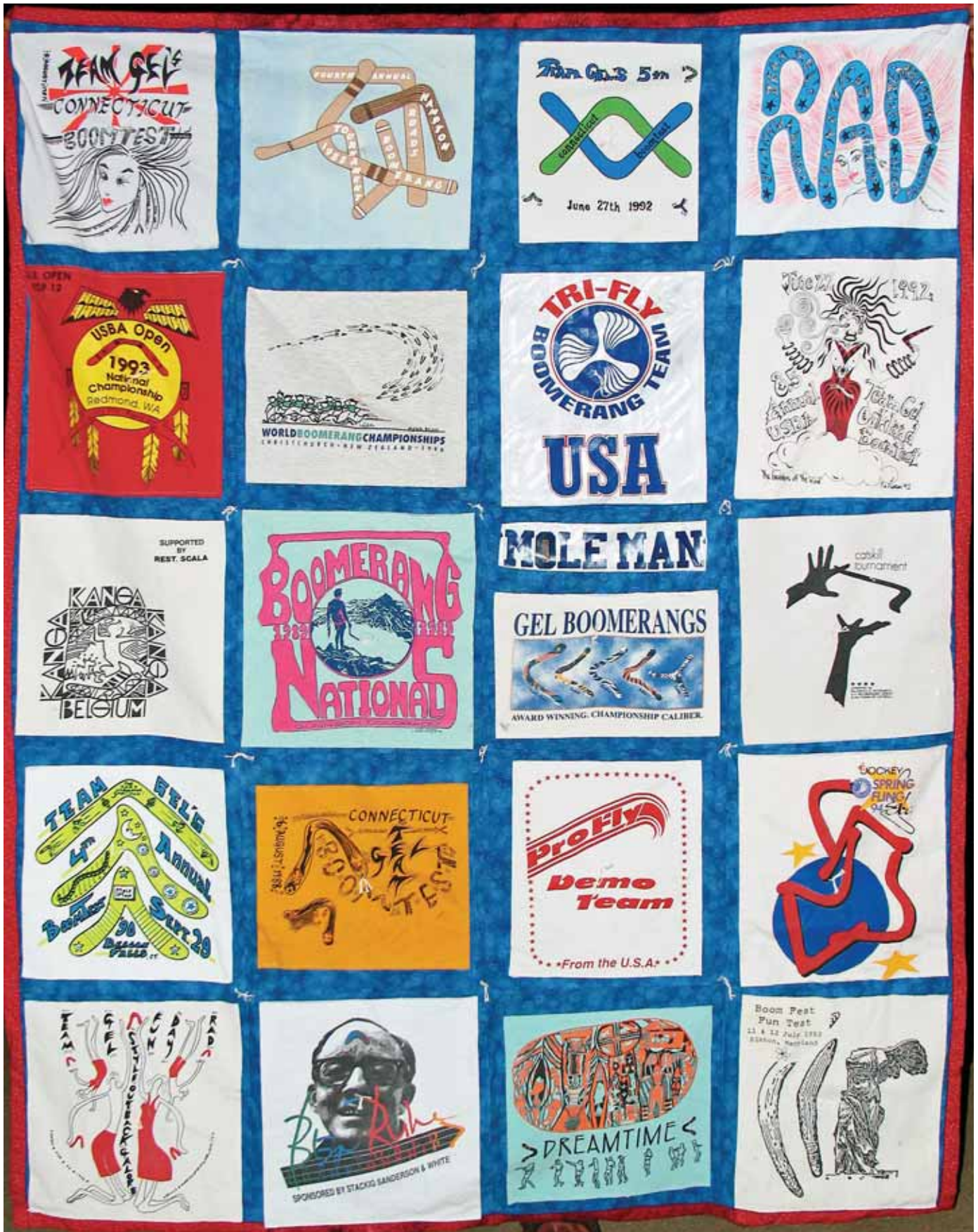
Moleman quilt made from collectable T-shirts